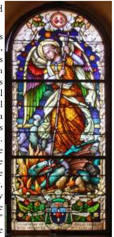
St. Michael the Archangel defeating the dragon, Satan.

One of the most striking elements of “Christ, the Lord of Hosts, Unshaken” is its imagery. As one sings this hymn, he can see what St. John describes in Revelation 12:7-12. This imagery makes this hymn wonderful for children, since the text helps to fuel their vivid imagination. The first stanza depicts Christ slamming Satan into his steely cage while stanza two bring St. Michael and the good angels into the picture, with their battle, the battle whose ending was known from the foundation of the world. However, Satan thinks he wins the battle by tempting Adam and Eve when he “made forbidden fruit look sweet.” Jesus overcame this by taking the whole worlds sin on His shoulders and the news of His victory “floods the earth and fills the sky.” Jesus’ glorious wounds are Satan’s eternal wounds by which He is forever defeated. Finally, we pray for the guidance of the angels, which God has promised us, and await Christ’s return, for which the Feast of St. Michael and All Angels prepares us.